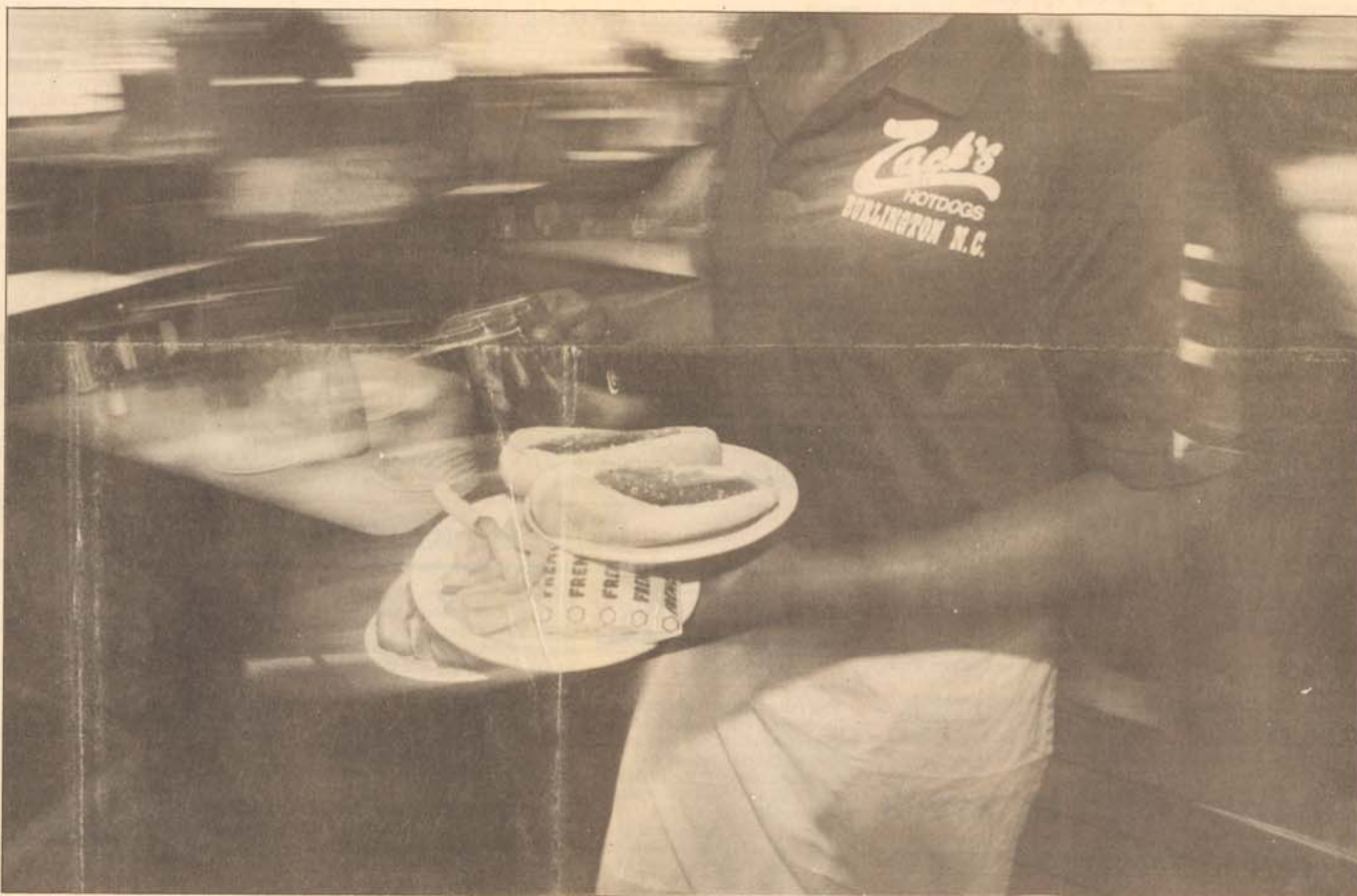
Above, Zack's is located on the same block of Worth Street where the original restaurant began in 1928. Right, Zack's claims customers get their orders within one minute.